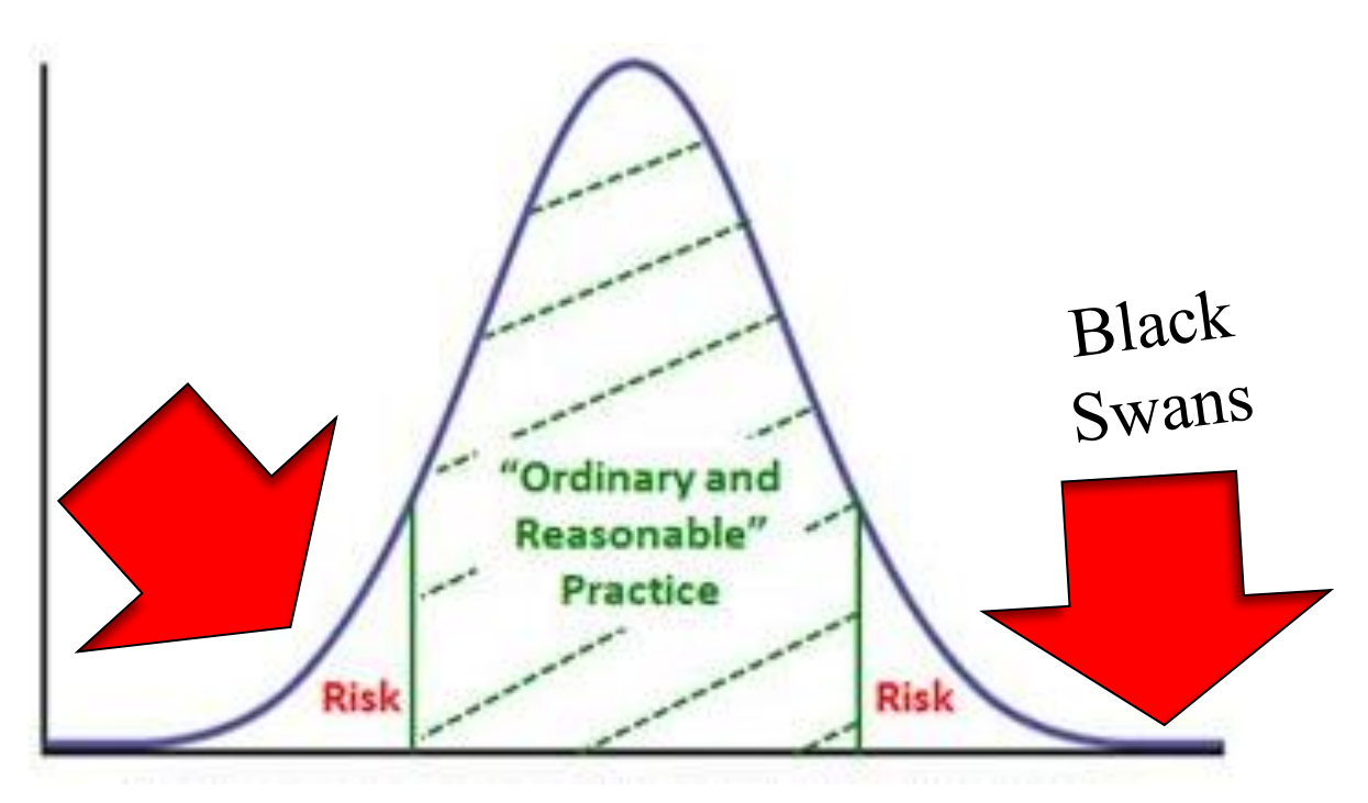
Size of a Loss Event - Impact