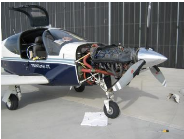
Another little issue