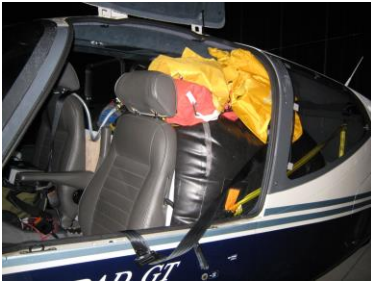
Ready to go