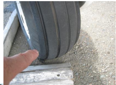
Hmm! a possible set back